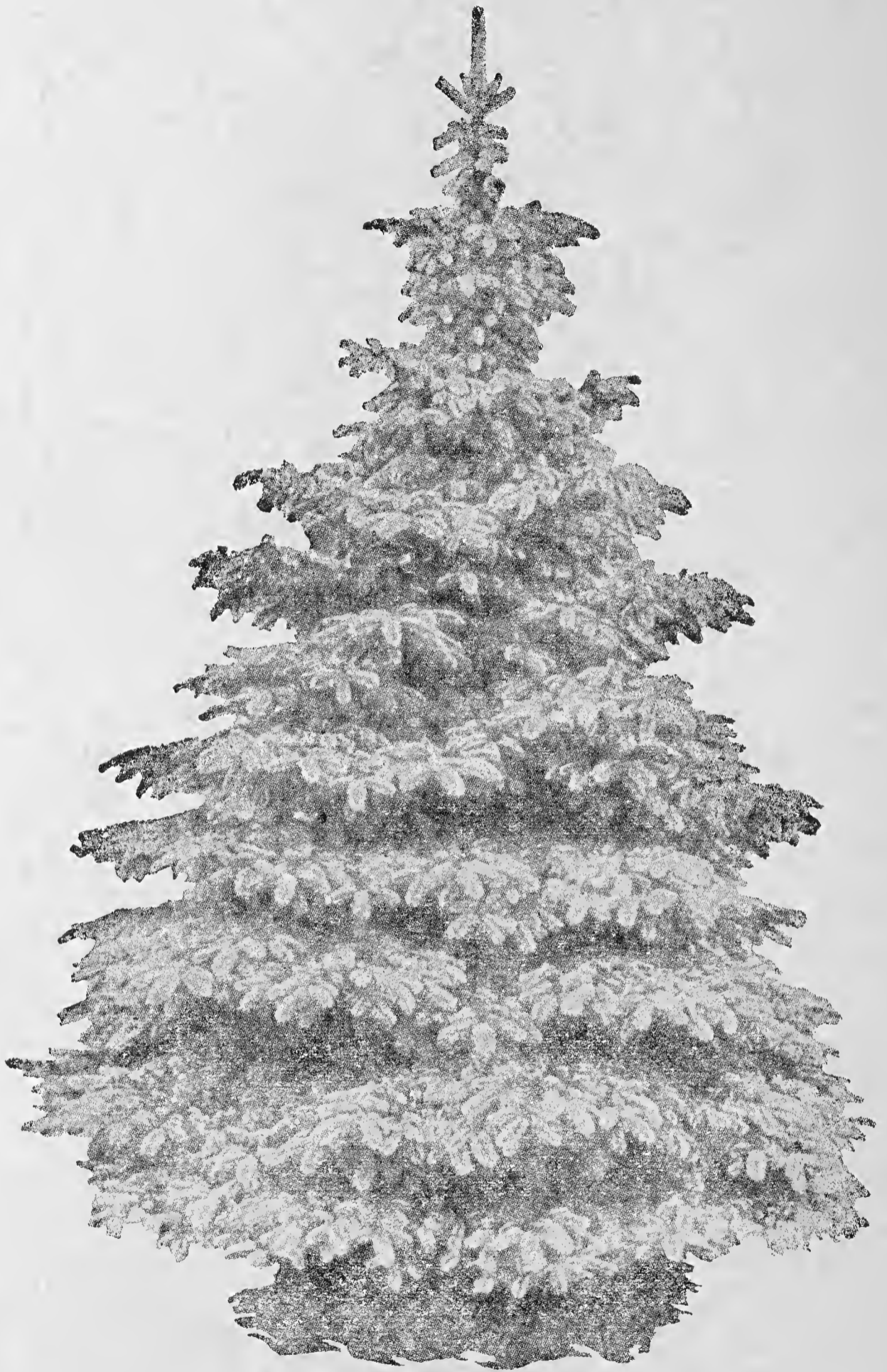
KOSTERS BLUE SPRUCE